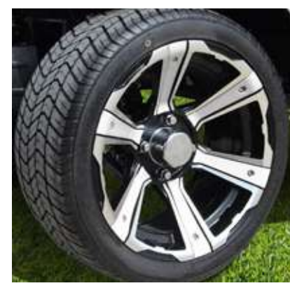
14" ALLOY WHEEL RIMS WITH COLOR MATCHING INSERTS AND RADIAL DOT TIRES