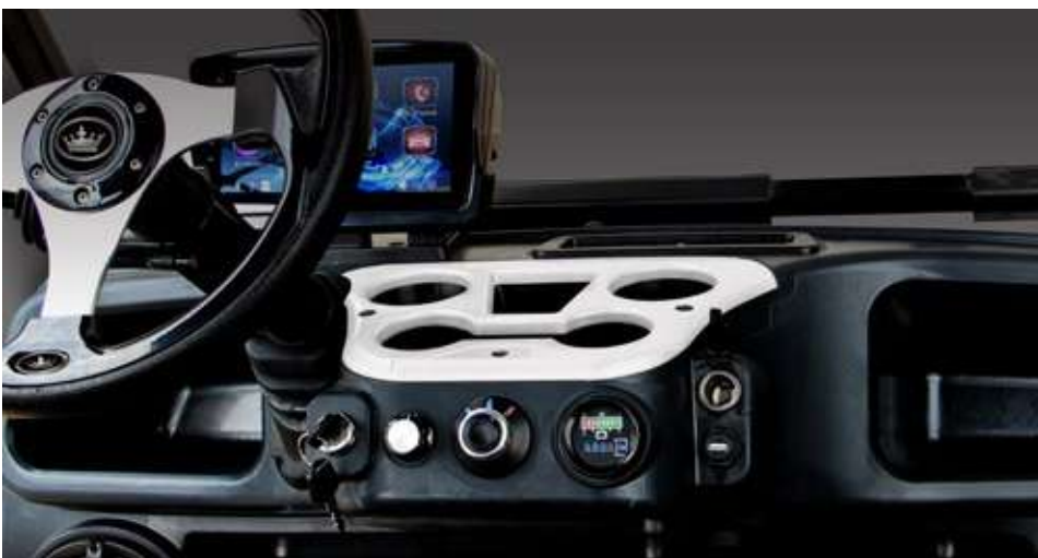
AUTOMOTIVE DESIGNED DASHBOARD, COLOR MATCHED CUP HOLDER INSERT