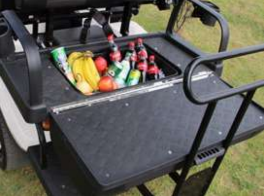
REAR-FACING, FLIP-FLOP SEAT KITS WITH STORAGE COMPARTMENT