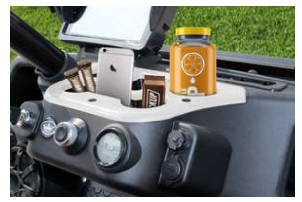
COLOR MATCHED DASHBOARD WITH FOUR CUP HOLDERS/CELL PHONE HOLDER