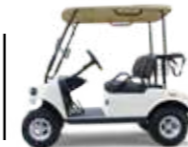
CLASSIC 2 EEC