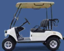
CLASSIC 2 EEC