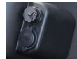
TWO USB CONNECTIONS