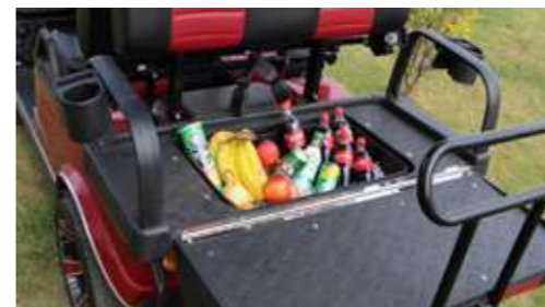
REAR-FACING, FLIP-FLOP SEAT KITS WITH STORAGE COMPARTMENT