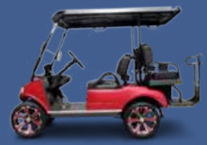
CLASSIC 4 PLUS