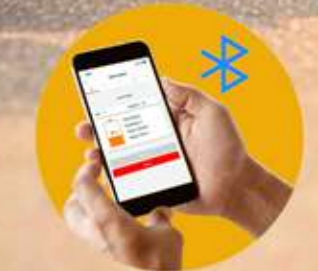
Mobile & PC Live Monitor