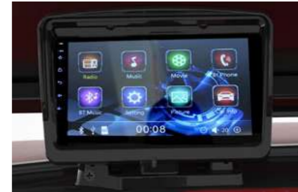
OPTIONAL 9" TOUCH SCREEN (RADIO, MUSIC, SPEEDOMETER, BLUETOOTH, BACK-UP CAMERA, CAR APP CONNECTION)