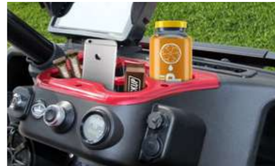
COLOR MATCHED DASHBOARD WITH FOUR CUP HOLDERS/CELL PHONE HOLDER