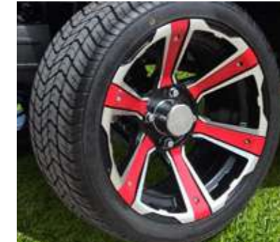
14" ALLOY WHEEL RIMS WITH COLOR MATCHING INSERTS AND RADIAL DOT TIRES