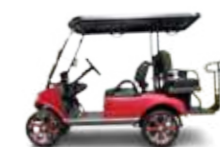
CLASSIC 4 PLUS