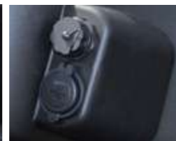
TWO USB CONNECTIONS