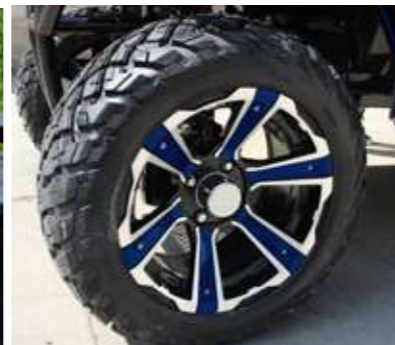
14" ALLOY WHEEL RIMS WITH COLOR MATCHING INSERTS AND SILENT TIRE WITH OFF-ROAD THREAD