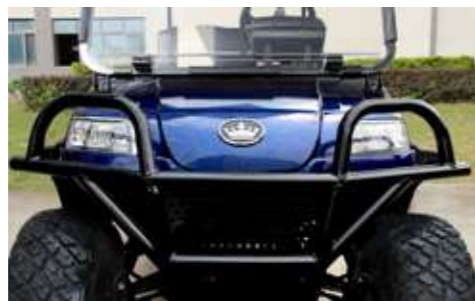
HEAVY DUTY BRUSH GUARD