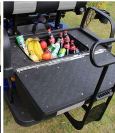
REAR-FACING, FLIP-FLOP SEAT KITS WITH STORAGE COMPARTMENT