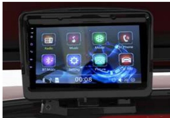
OPTIONAL 9" TOUCH SCREEN (RADIO, MUSIC, SPEEDOMETER, BLUETOOTH, BACK-UP CAMERA, CAR APP CONNECTION)