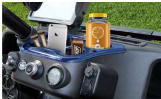
COLOR MATCHED DASHBOARD WITH FOUR CUP HOLDERS/CELL PHONE HOLDER