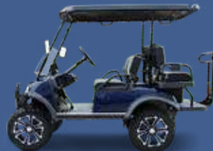
FORESTER 4 PLUS