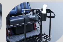
Golf Bag Holder