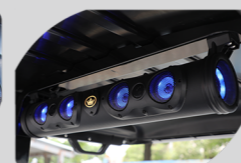
Cylindrical Evolution Sound Bar