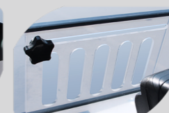
Slideable Air Vents