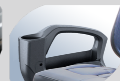
Rear Armrest With Built-in Storage Compartment