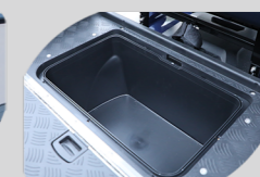
Rear Storage Compartment