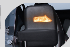
Powered Rear View Mirrors