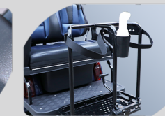
Golf Bag Holder