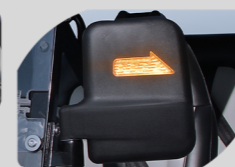
Powered Rear View Mirrors