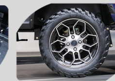
Silent Tire with Off-road Thread