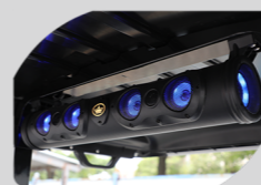
Cylindrical Evolution Sound Bar