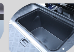
Rear Storage Compartment